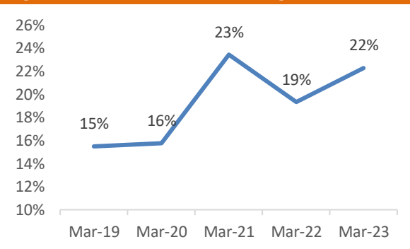
Figure 3: Improving Net Profit